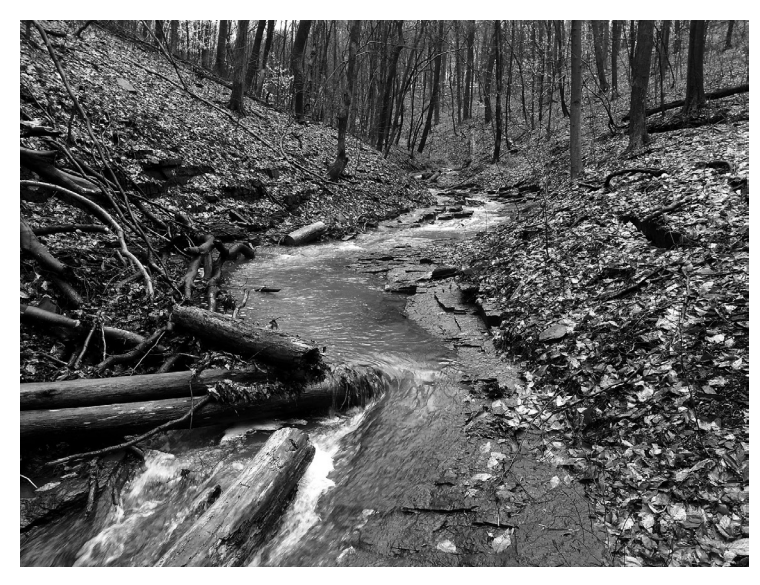
Come for a relaxing hike on the Neal Thorpe Trail in the cool ravines and woodlands.