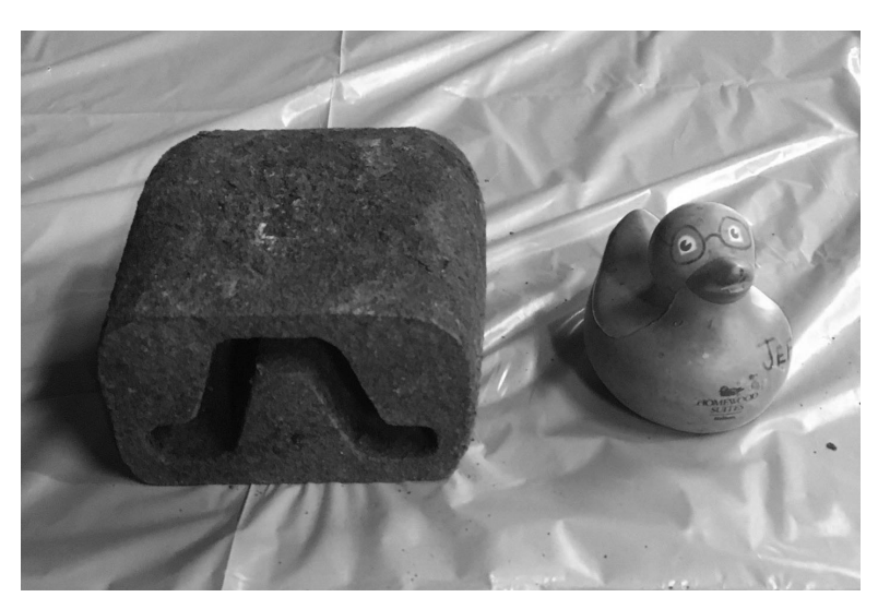
What is this heavy iron relic used for? (Duck for scale)